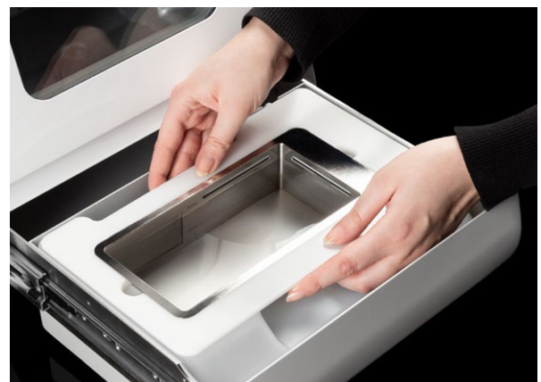
The large fluid tank can easily be removed from the drawer.

The tool magazine can be inserted quickly and effortlessly in just one step. The automatic changer offers space for up to eight tools. The three compartment block holder is another highlight. That makes the N4+ the ideal partner for research and practice laboratories.