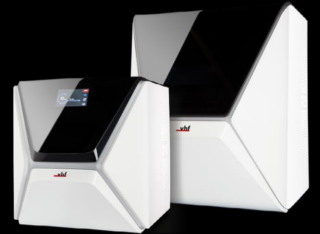
HIGH END CLASS